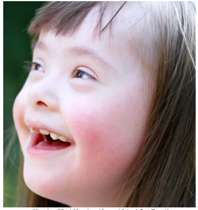
Monday 22nd March - 10am - Virtual Get Together